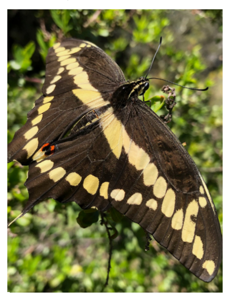
4. Papilio rumiko