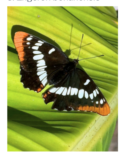
8. Limenitis Iorquini