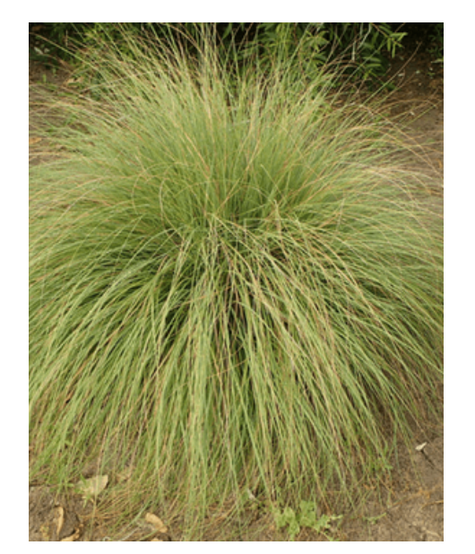
3. Muhlenbergia rigen