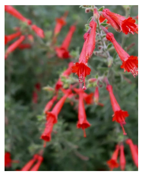
2. Epilobium canum