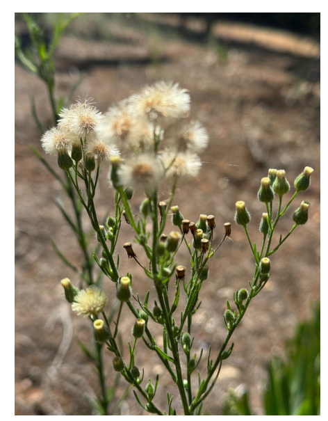
5. Erigeron bonariensis