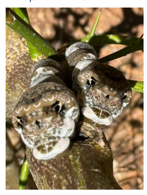
7. Papilio rumiko