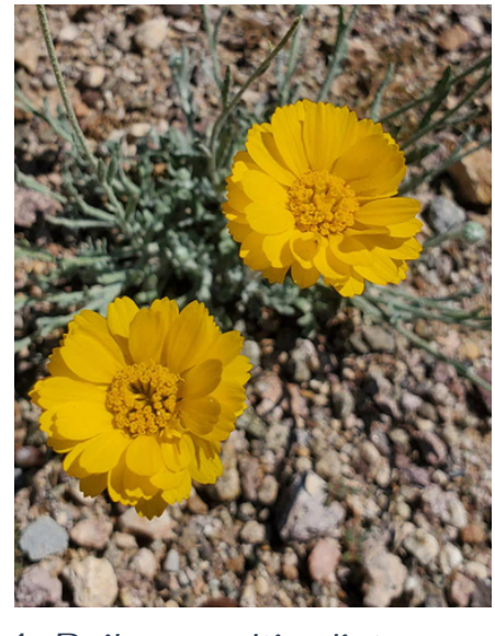
1. Baileya multiradiata