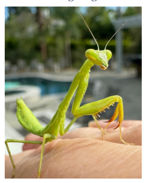
6. Stagmomantis limbata